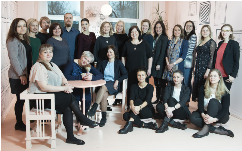
All for one, one for all – against child abuse! This is the staff of Center Dardedze, which has been our partner in Latvia since 2015.

By now, literally hundreds of thousands of children have benefited – more than 22,000 in 2019 alone. So we believe we are funding not just education, we are supporting hope and progress. The world may have changed radically, but the work continues.