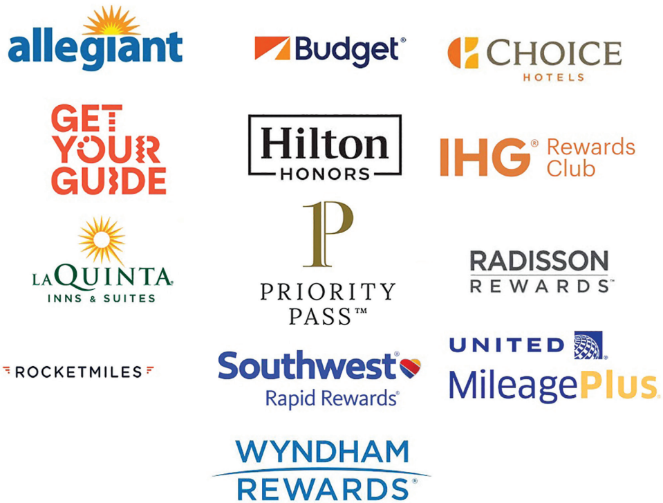
2019 InsideFlyer.com web banner

The Kids First Fund thanks our 2019 donor companies: