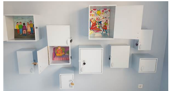
Dzimba's working room, where good and bad secrets are kept in lockers. If you open a locker with a good secret, you can lock it and keep the secret there. If you open a bad secret locker, you have to leave it open to remember that the bad secrets must be told to someone you trust.