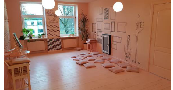
Dzimba's living room, where Dzimba reads his big Safety Book to the children, which contains a lot of rules on how to be safe in a relationship.

The center also added a “traveling Dzimba” project in 2019, which brings the puppet program and its child abuse prevention message to remote regions of Latvia in which children, teachers and other caregivers cannot easily travel to Riga to visit the Dzimba Safety House. The new program visited four outlying municipalities to present 60 sessions, reaching almost a thousand kids. Meanwhile, the original facility based Dzimba program in Riga has been shortened, made more interactive, and had its space expanded, all to accommodate more children. In the fall of 2019, more than 98 percent of the 1,629 children who visited the new Dzimba's house “liked” their session by placing a sticker on the wall. For the whole year, 10,083 children, 7232 parents, 2505 teachers learned about personal safety from Dzimba.