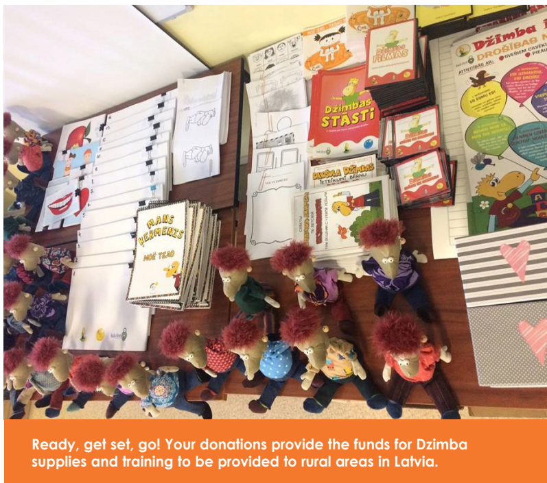
Ready, get set, go! Your donations provide the funds for Dzimba supplies and training to be provided to rural areas in Latvia.

All of this interaction significantly helps reduce the risk of child abuse for these families.