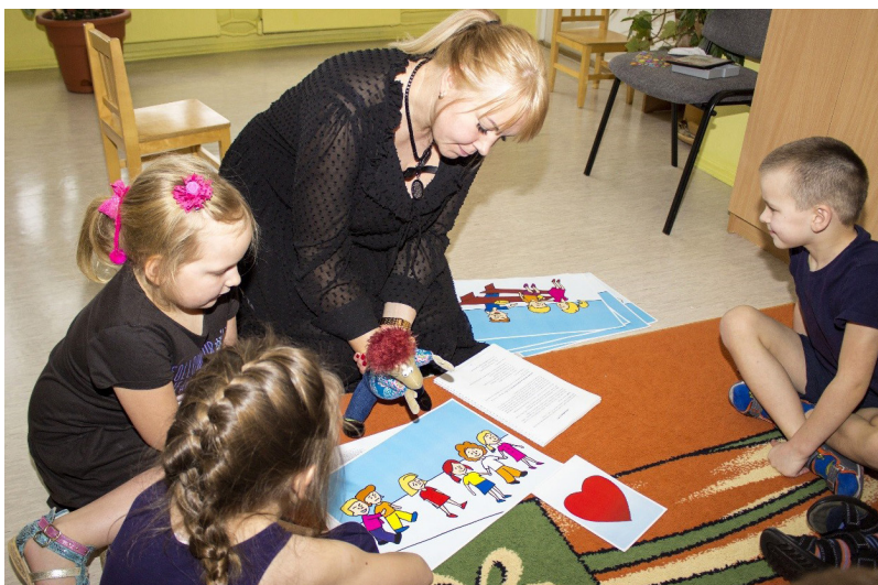
Dzimba in action. Children are eagerly engaged by the Dzimba character by a Center Dardedze trained teacher.

The Kids First Fund has a tradition of focusing on rural areas, which often receive fewer resources to prevent child abuse. Large cities have the benefit of greater access to treatment facilities, concentrated political power, and attract more professionals. Rural areas truly appreciate a helping hand and are eager to work with organizations to compensate in areas where they are lacking. Center Dardedze is very effective at identifying municipalities where the need is substantial and local authorities have the capabilities required to implement the Dzimba and Guardian Angel programs.