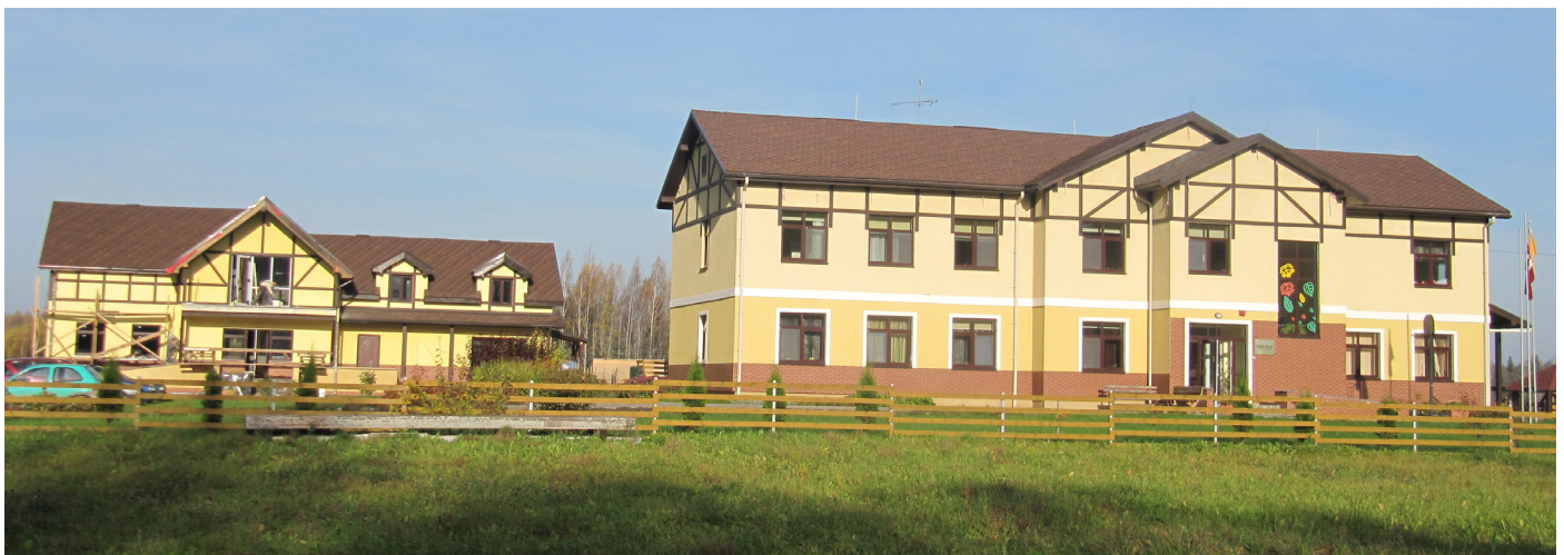
The new support building is pictured above, to the left of the main building.