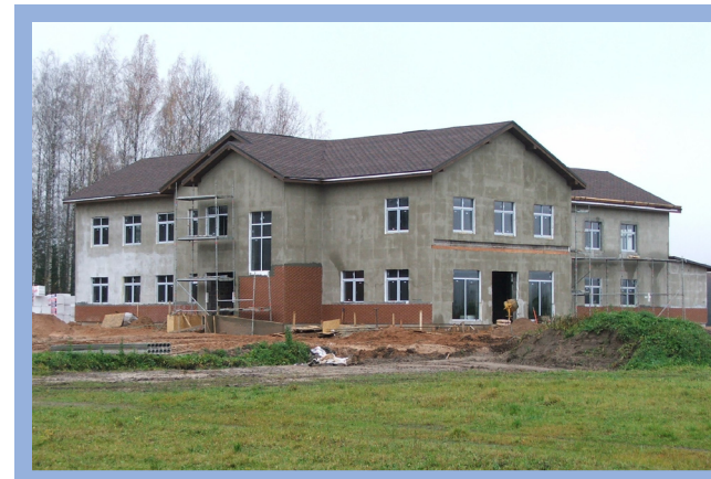
This image from October 2008 shows completion of the roof, installation of windows, and the final stages of exterior finishing.

Construction of the family shelter began in 2008 and is planned to be completed in June 2009.