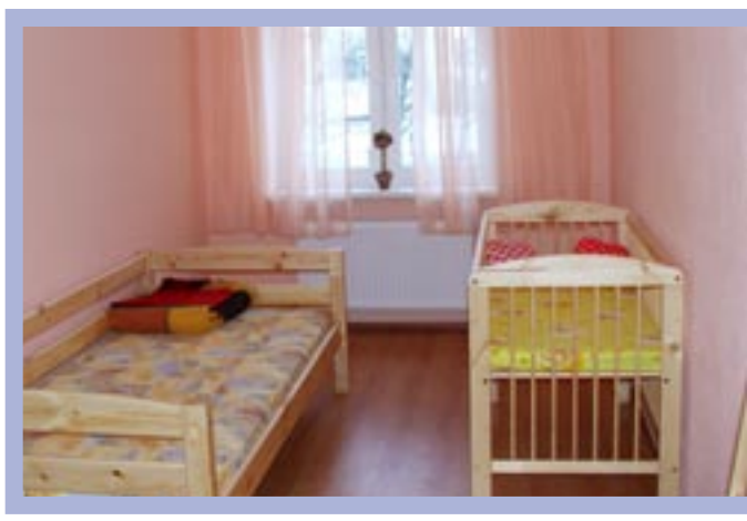
Your donations added more furniture and other home touches to the shelter in Valmiera.

These are not large items, but this grant certainly improved the lives of abused children and their mothers in a little piece of Latvia. Your contributions allowed this small act of compassion to occur.