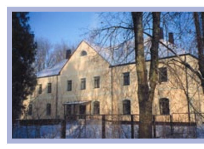
Exterior image of the renovated shelter in Valmiera, Latvia

The building was extensively renovated during 2005 to accommodate its new role as a family shelter. The lower floor consists of administrative offices, therapy rooms, and a meeting room which doubles as a family