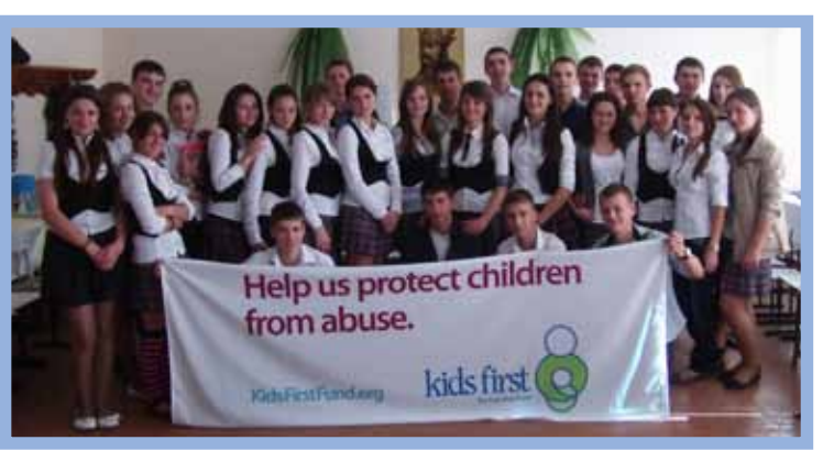
Students from a Peresecina High School in Orhei, Moldova participate in a session to learn how to protect themselves, friends, and siblings from abuse and bullying.

Most importantly, the participants recognize the school environment is crucial in the prevention of violence. A collaborative effort involving other professionals, parents, and children is key. The project will continue with seminars planned for six more regions during 2012. Three regions have already been chosen: Cantemir, Stefan Voda, and Criuleni.