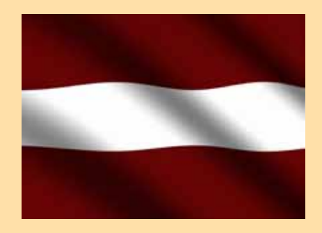
REPORT FROM LATVIA

"...through all these challenges, our family shelter continues to succeed in its mission to support abused children and their mothers."