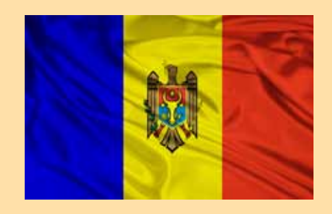
REPORT FROM MOLDOVA

"It's obvious this project is touching many lives."